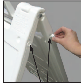
Sand Fill Holes

Each sign frame has four fill holes, two on each side of the frame.